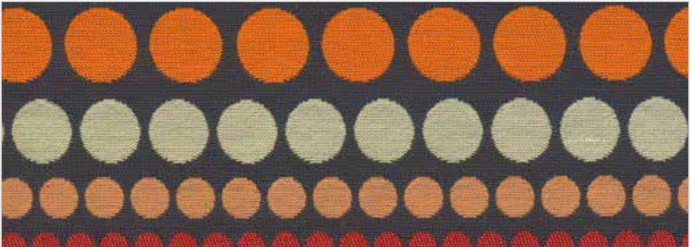
OD82 Chili Powder